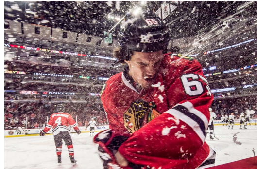
Blackhawks vs. Penguins, January 2016